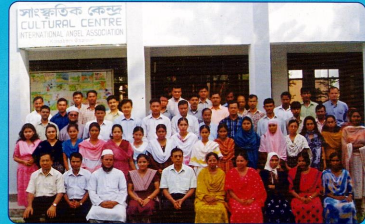
Staffs of International Angel Association, Bangladesh