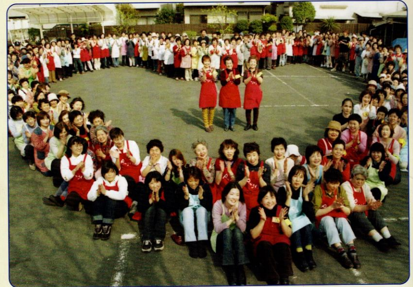
Members of International Angel Association in Japan

Voluntary Organisation of Japan Konabari, Gazipur, Bangladesh