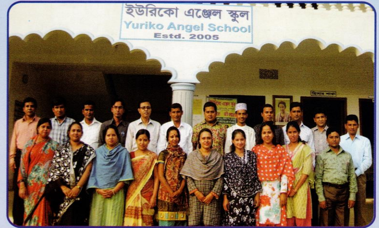
Staffs of International Angel Association, Bangladesh