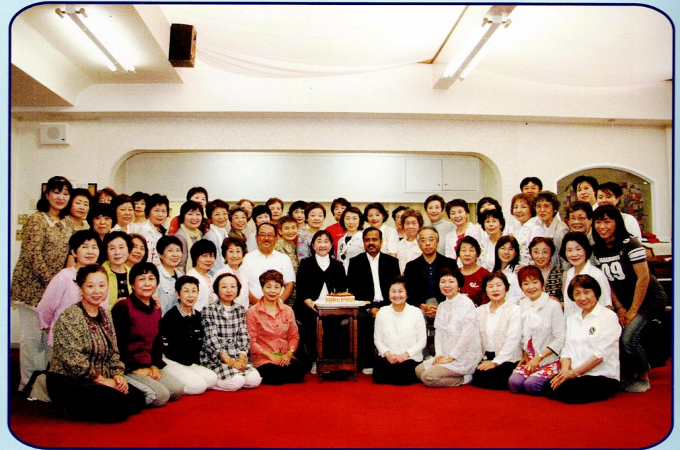
Members of International Angel Association in Japan