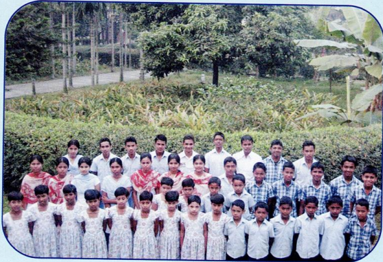
Children of Angel Home

1. Shishu Sadan (Orphanage) : 145 Children included this program since 1986. This year 60 children accommodated in Shishu Sadan. The organisation will go on guiding their with proper care until they become self-reliant and acquire the ability of maintain their livelihood.